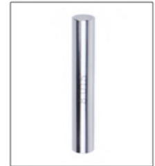
inspection gauge (included)